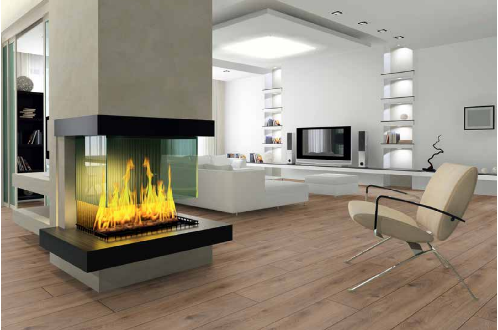
Prestige Oak Nature - D 4166 ER