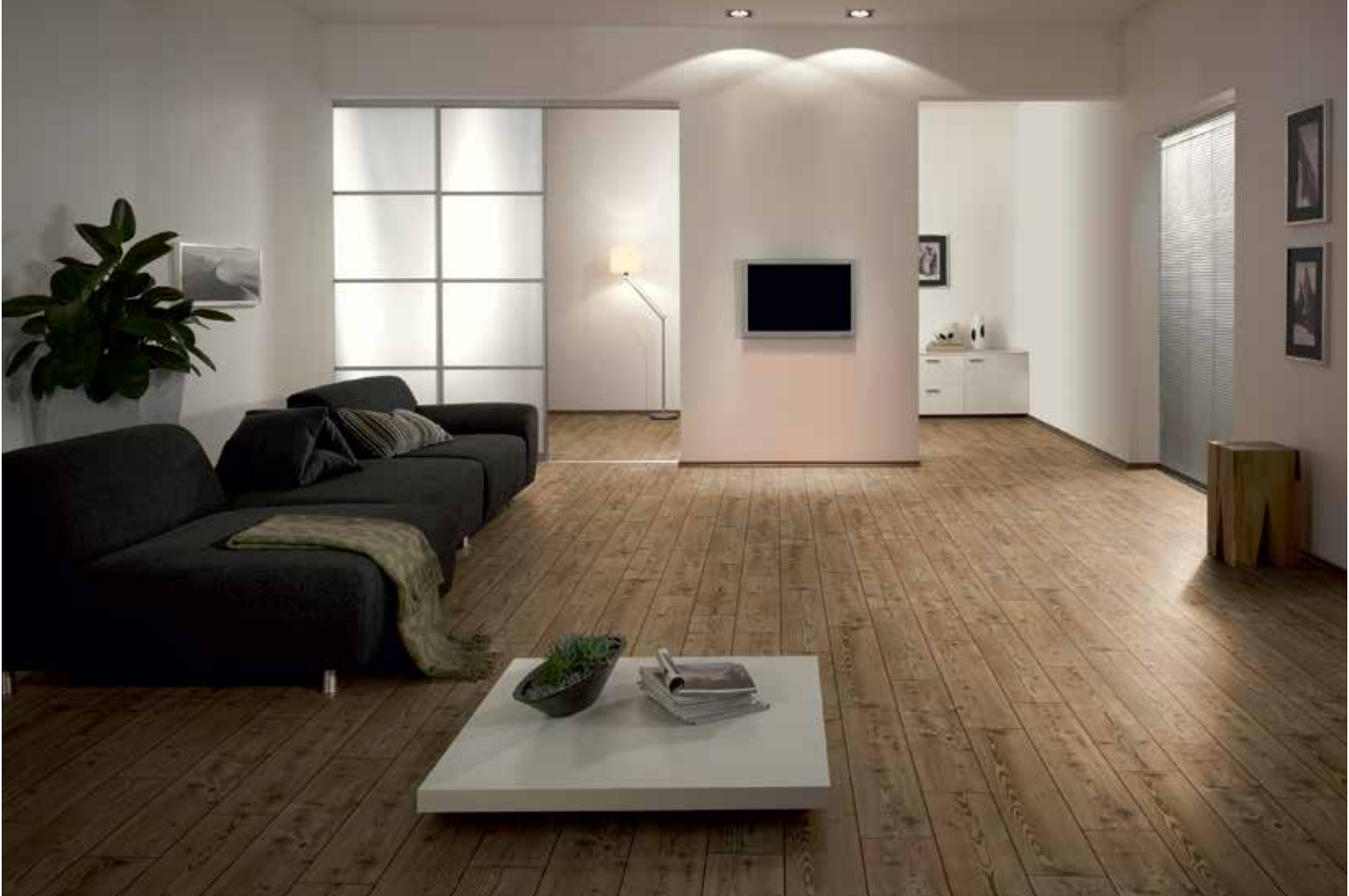
Natural Pine - D 2774 MX