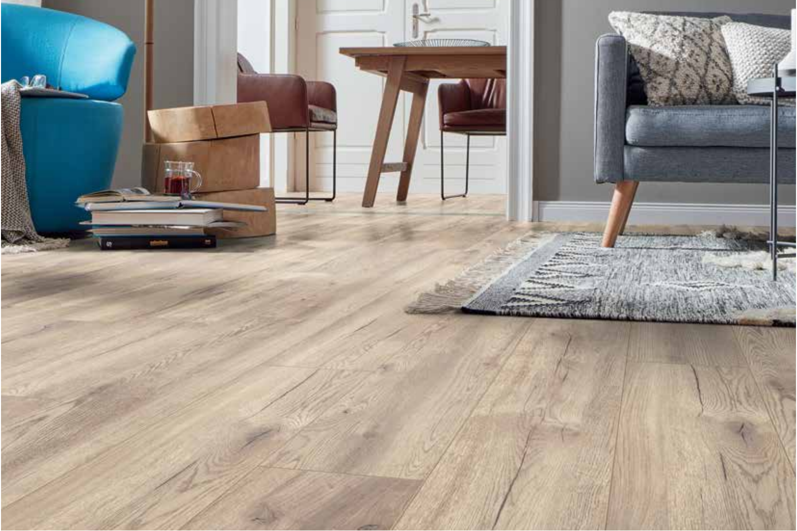
Petterson Oak Beige - D 4763 ER