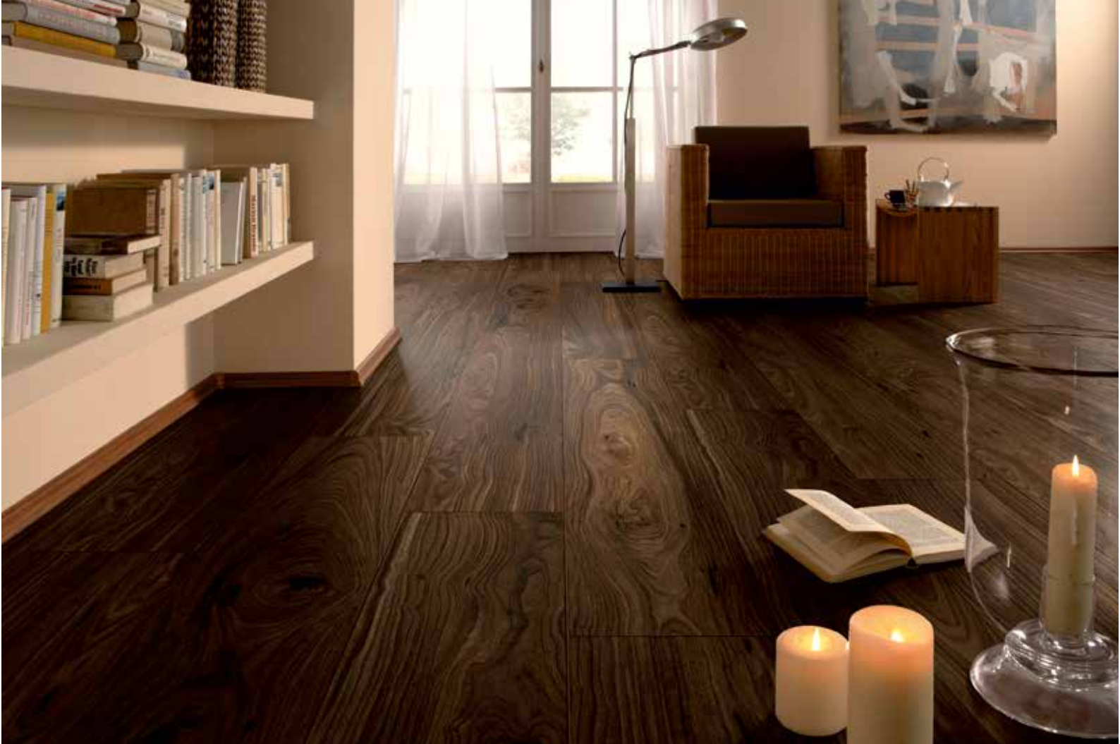
Tuscany Walnut - D 3070 ER