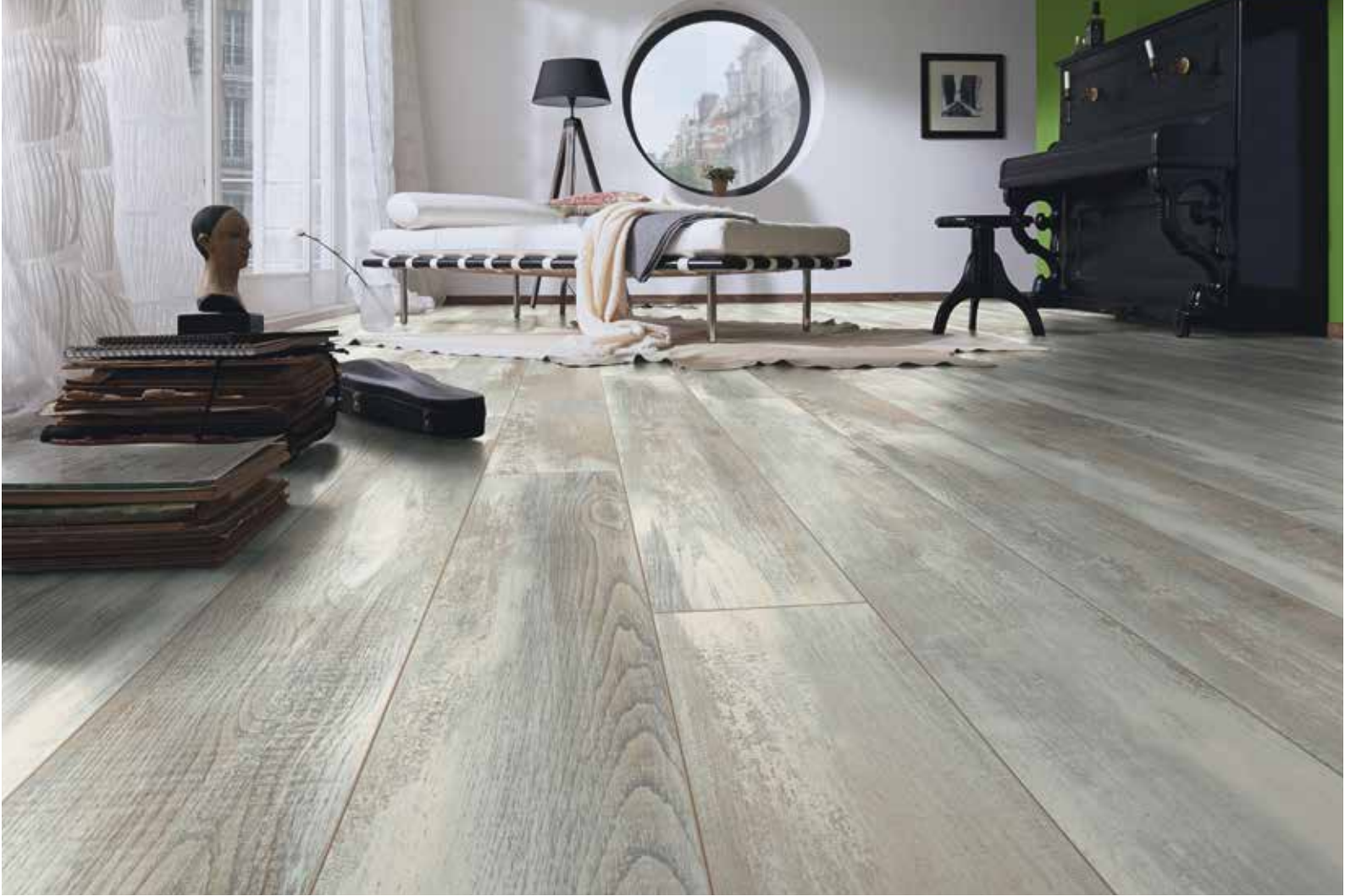
Hella Oak - D 4754 UL