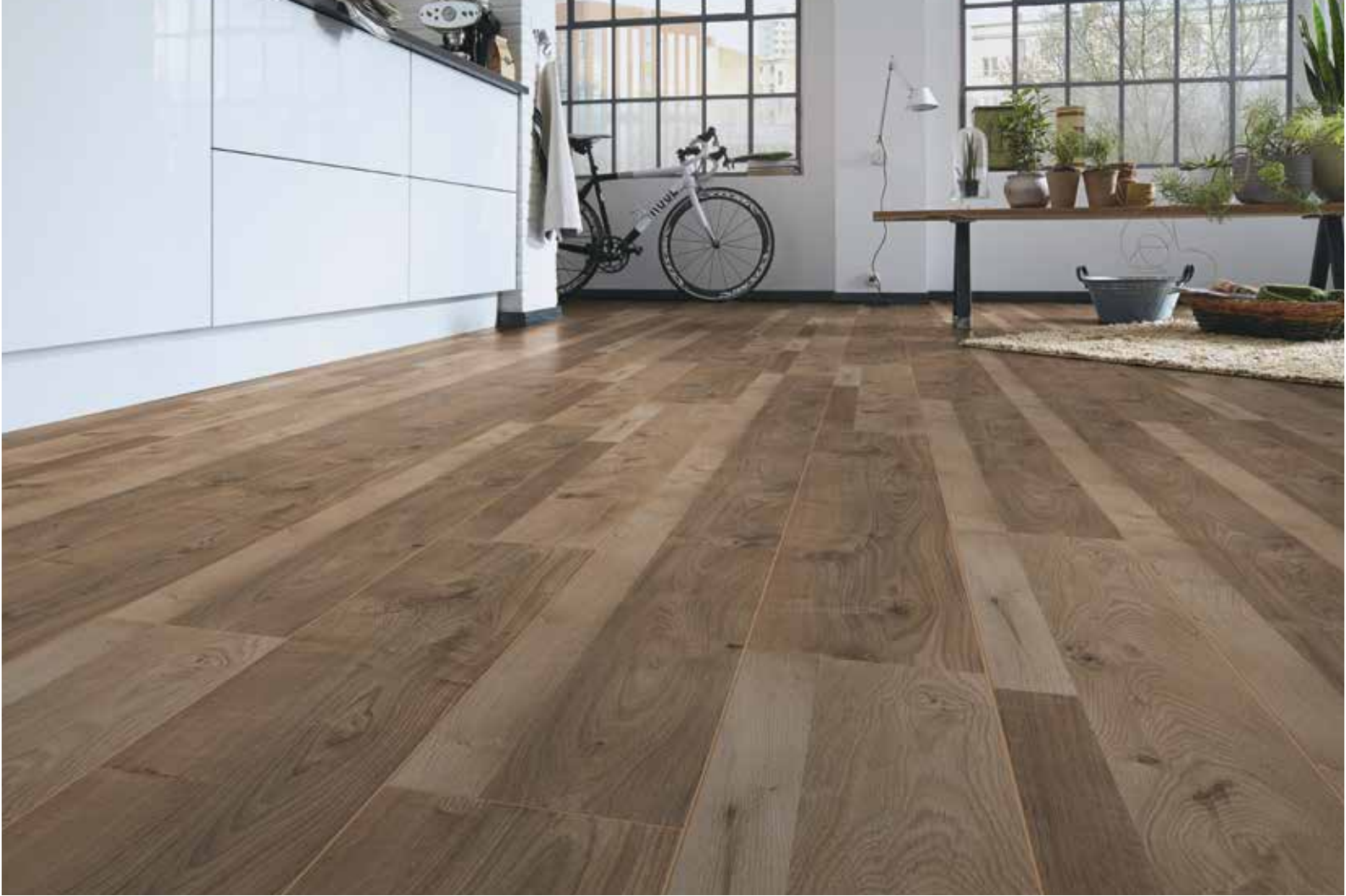
Rosemont Oak - D 3665 AF